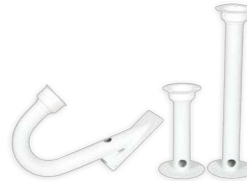
ZCA-GT200, ZCA-ST25, ZCA-ST50