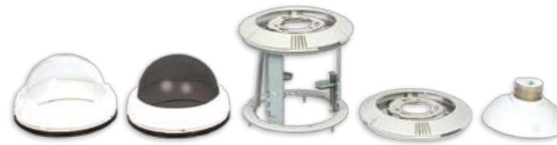
ZCA-CBXT, ZCA-SBXT, ZCA-TB200, ZCA-HC200, ZCA-IPA

Introducing the ZC-PT series CBC has made a decisive step to offer a more complete and comprehensive solution. Dome cameras have to be versatile and have to contribute a price and performance ratio that makes monitoring facilities a cost-effective investment. Its usefulness is its intelligence and hassle-free use. The assembler will choose the appropriate version and will define the assembly options available – that is it.