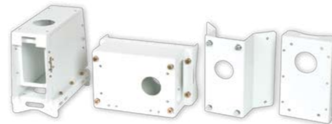
ZCA-PTB, ZCA-PWB, ZCA-CST, ZCA-PWDM