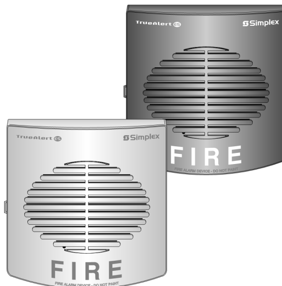
TrueAlert ES Addressable Horns are Available in Red with White Lettering and White with Red Lettering