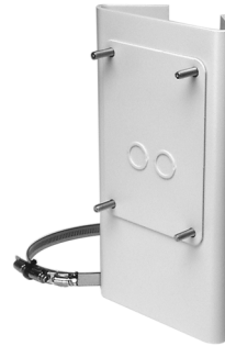
PA402 SHOWN WITH REMOVABLE BLOCK-OFF PLATE

The PA402 is a pole mount adapter designed for use with Spectra® and Legacy® wall mounts. For Spectra, DF5, or DF8 Series pendant domes, use the IWM Series and IDM4018 wall mount. For Legacy positioning systems, use the LWM41 wall mount.